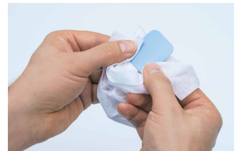
Image Plate Cleaning Wipe

These are perfectly tailored for a digital workflow with image plates or sensors and are also suitable for use with conventional systems.