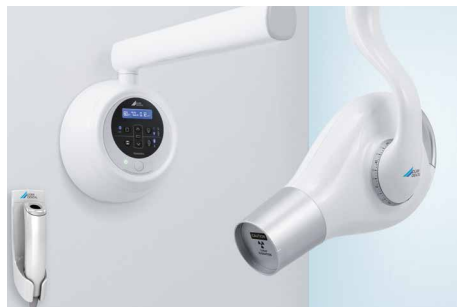
Image plate holders from Dürr Dental offer optimum protection for the image plate with their smoothed and rounded edges. Holders are available for all applications – using them helps to ensure that accurate X-ray images are produced.