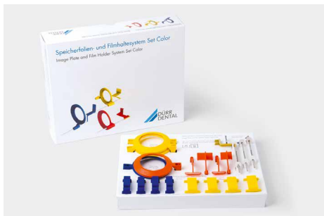
Image plate holder system

Image plate holders from Dürr Dental offer optimum protection for the image plate with their smoothed and rounded edges. Holders are available for all applications – using them helps to ensure that accurate X-ray images are produced.